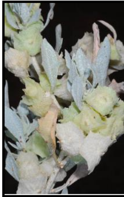
Prosopis glandulosa var glandulosa