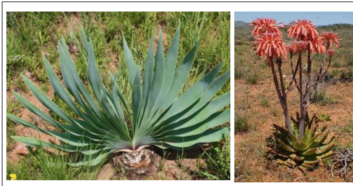
Figure 1: Identification photos of Boophone disticha (left photo) and Aloe maculate (right photo)

The few other species found on site are characteristic of grassland vegetation. The species diversity is hampered to some extent due to the periodic grazing that impacts this area and are classified as species of least concern (LC)