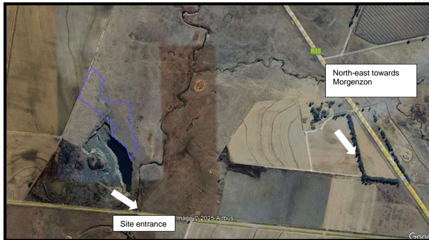
Figure 1: Satellite view showing the site entrance to the proposed mining area (blue polygon) and the direction towards the nearest town.