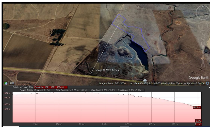
Figure 2: Elevation profile of the proposed mining footprint