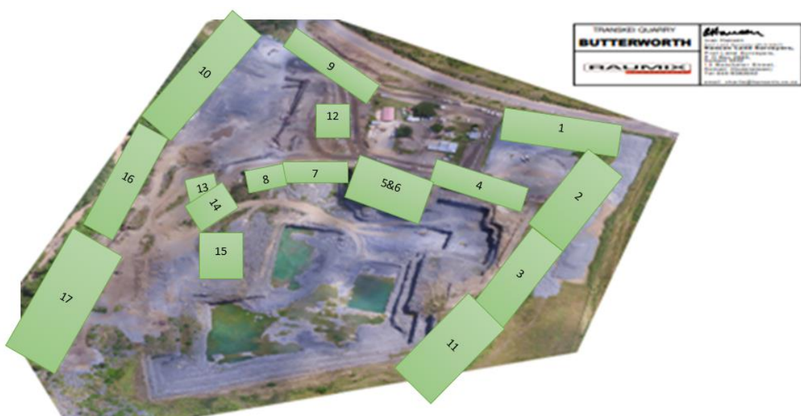
Figure 1: Division of the mining area into 17 management areas where invader plant species are

Butterworth Quarry has an Alien Invasive Species Removal Action Plan (2023) that divides the current mining area into seventeen (17) management areas as shown in the following figure. Once approved, the expansion area must be added to the plan and form part of the invasive species management practices.